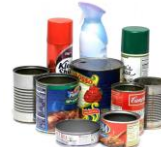
Steel and Tin Cans (Latas de hojalata y fierro)