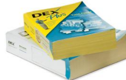
Phone Books (Directorios)