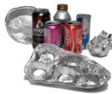
Aluminum Cans & Foil (Latas de aluminio y papel aluminio)