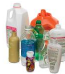
Plastics #1-#7 (Botellas de plastico #1-#7)